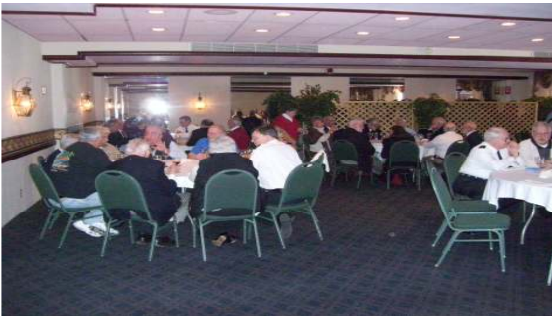
The gang enjoys the noontime meal before returning to work.