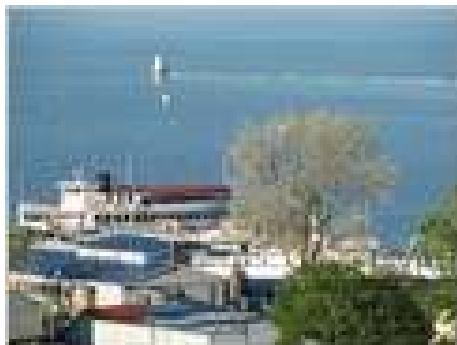
Burlington Vermont waterfront

Please see the announcement flyer on page 18.