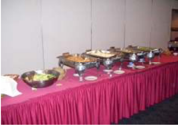
No meeting is complete with a buffet.