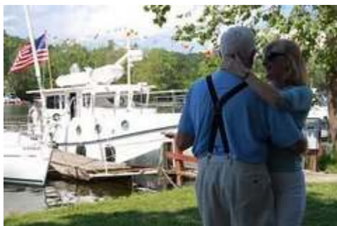
The best is yet to be!