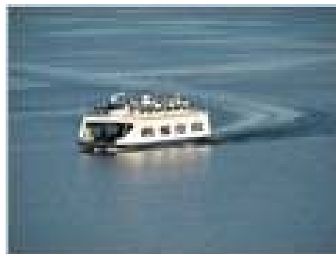
Ferry on Lake Champlain