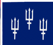
MHPS Commander's Message February 2009

We are getting there. Winter is moving along and spring is almost around the corner. We still have snow and ice to contend with, but the sun is higher in the sky; the days are growing longer and warmer weather will arrive.