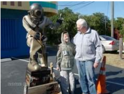
What can you tell me about diving, Grandpa? Want a pet iguana? Uffda! Not me!