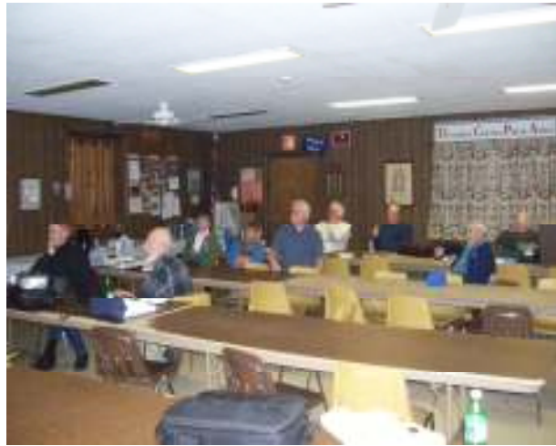
A FINE CROWD WITH UNDIVIDED ATTENTION