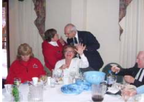
What a handsome group!