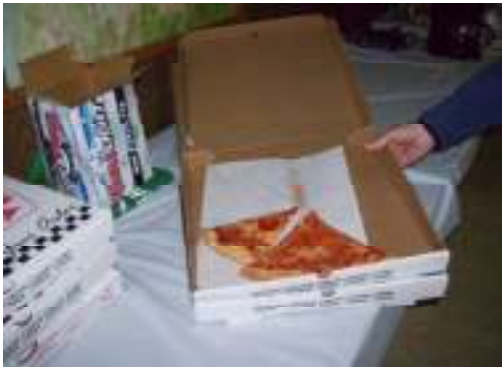
HURRY IF YOU'RE TO EAT