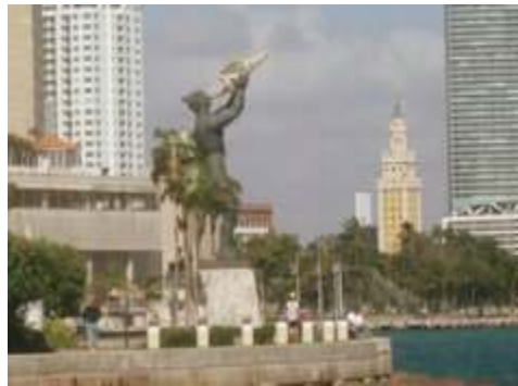
Blowing the Conch Shell, Miami