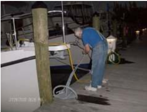
There is always something to fix!