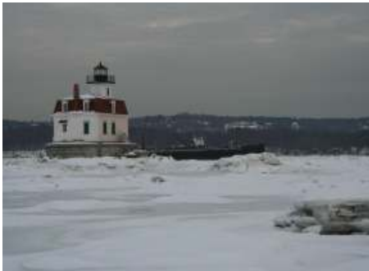
Esopus Lighthouse 7 February 2009...1700

the FOGHORN power of the pen : Award Winning Newsletter 2008