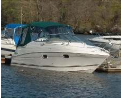
2004 FOUR WINNS 248 VISTA 24 Ft 26'2" LOA 8'6" BEAM EXELENT CONDITION 130 Hours

26'6" WITH SWIM PLATFORM - 8'6" BEAM - 5.0 VOLVO PENTA OSI/X DUO PROP SS COMPOSIT OUTOUTDRIVE - WINDLESS - COCK PIT COVER & FULL CAMPER COVER - VHF - LORAN 68M COLOR GPS MAP/FISH FINDER - AM/FM/CD WITH REMOTE ON SWIM PLATFORM - STOVE - AC/DC REFRIGERATOR -BBQ GRILL - HEAD - SLEEPS 4 - 2004 FOUR WINNS CUSTOM TRAILER W/SURGE BRAKES.