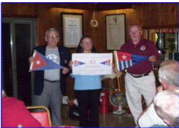
Honoring Poughkeepsie Yacht Club and the Mid-Hudson Power Squadron