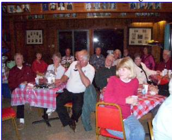
What a handsome crowd at PYC.