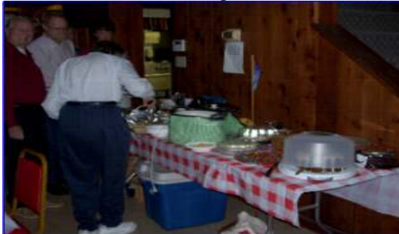
Plenty of eats at PYC.