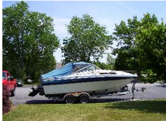
1989 Celebrity 224SE 350 Chevy Engine.... 260 HP 22.4ft Cuddy Cabin...fully equipped Low Hours.... 1990 easy load trailer Purchased new...June 1989

CONTACT ANDY 845-876-0761 or agizmofish@yahoo.com $45000 or Best Offer