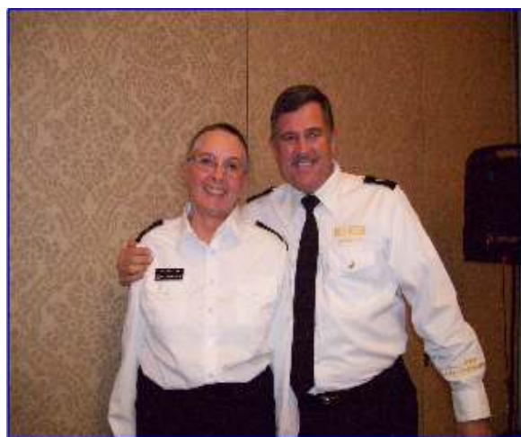
The Chief with his new friend!