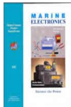
Coming Soon on Friday's.