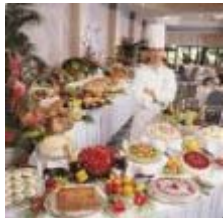
All this food, and so little time!

Uniform: A or F or G or Appropriate Attire