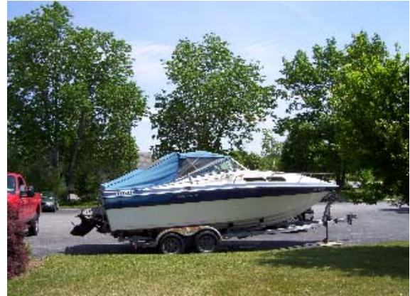
1989 Celebrity 224SE 350 Chevy Engine... 260 HP 22.4ft Cuddy Cabin... fully equipped Low Hours.... 1990 easy load trailer Purchased new...June 1989

CONTACT ANDY 845-876-0761 or agizmofish@yahoo.com $45000 or Best Offer