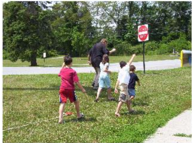
Doing the 50-50-50-50 at East Fishkill