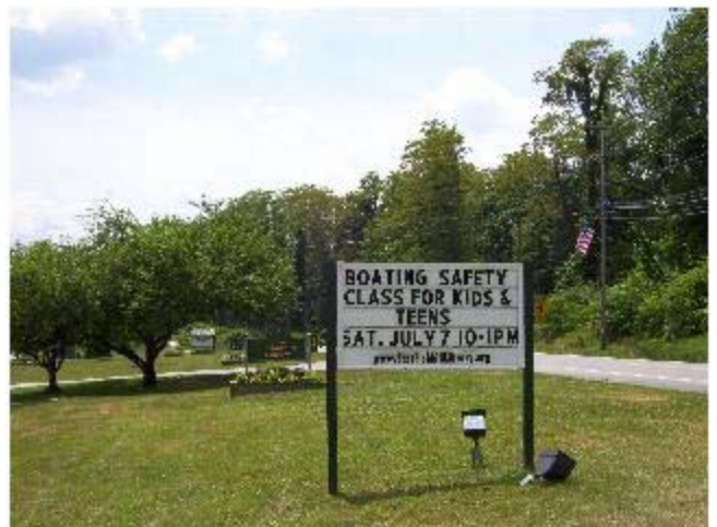
The "Pitch on the Lawn" at East Fishkill